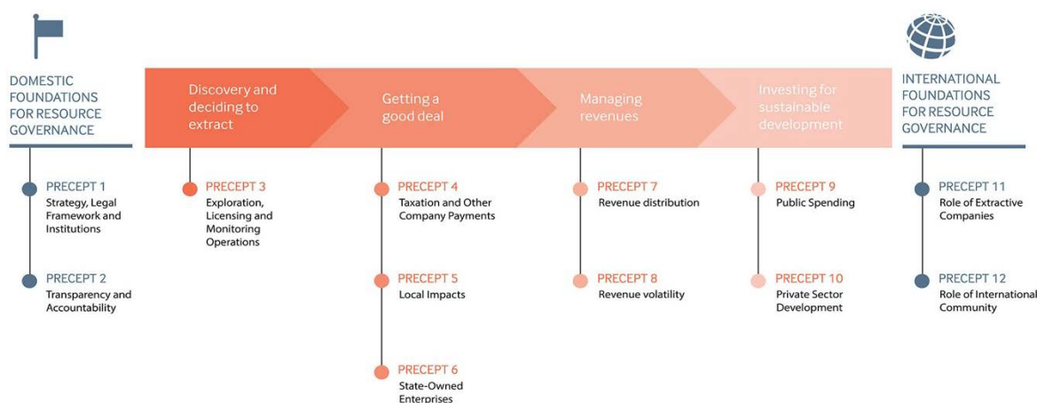
Figure 3: The natural resource charter decision chain